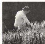
A scientist's primer to Benito Vergara National Scientist