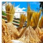
The seed keepers' treasure