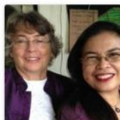
Women who moved mountains